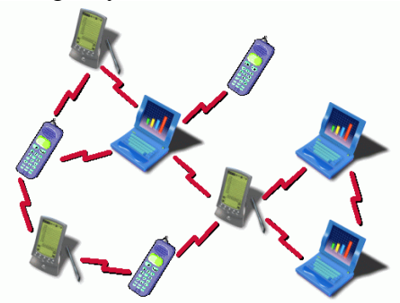
Fig1. Wireless MANET