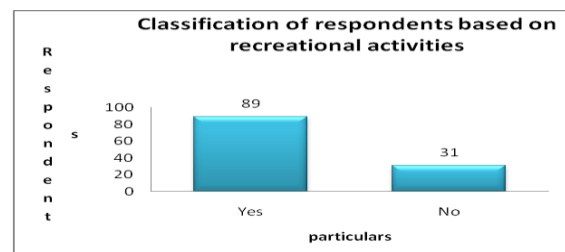
Fig 3: Classification of Respondents Based on Recreational Activities