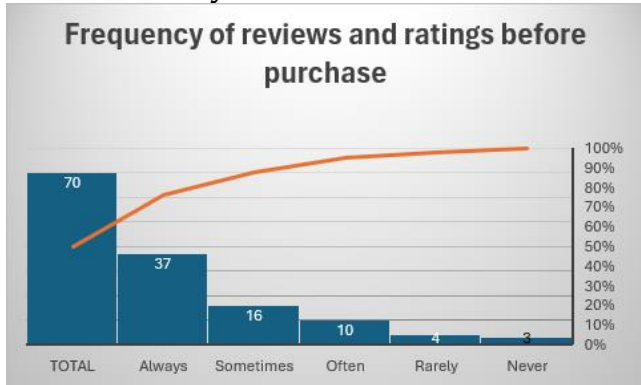
Fig 4: Frequency of Reviews and Ratings before Purchase