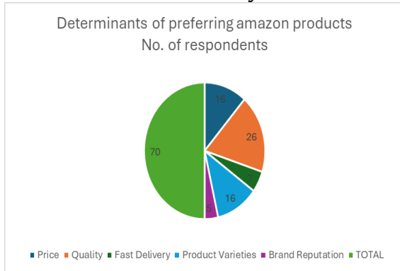
Fig 2: Determinates of Preferring Amazon Products No.of Respondents