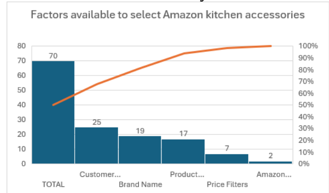
Fig 3: Factors Available to Select Amazon Kitchen Accessories